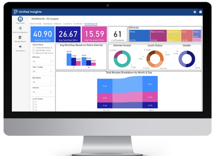
Better understand distance learning adoption

Quickly access shared reports and save them to your "favorites" for quick access.